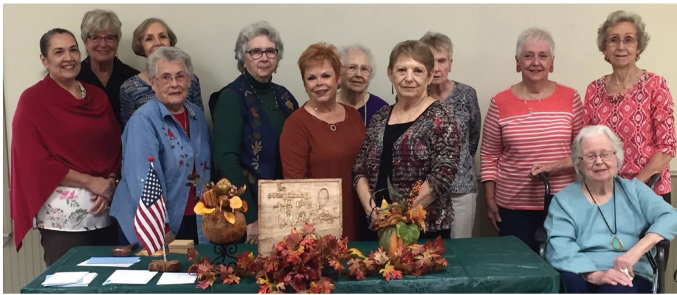
Some of the ladies of The Potpourri Club which donated funds to Society of Samaritans by holding a Spring Tea - an authentic traditional British Tea.