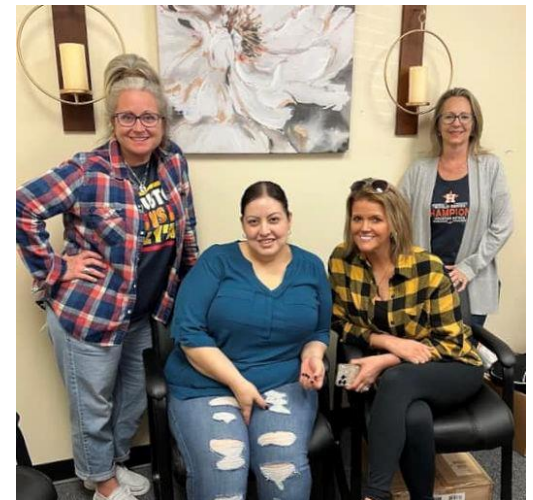
Meet Members of the Society of Samaritans Staff (left to right):

Here at Society of Samaritans our Volunteers are at the heart of the Ministry. This team of dedicated individuals as well as SOS Ministry Staff work hand in hand in a combined effort to serve others with compassion, love, prayer and guidance.