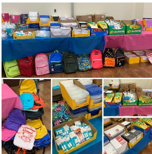
Backpacks and school supplies give out at KIDSfest.

This year, The number of children attending KIDSfest 2022 more than doubled from the previous year. We are thankful for the overwhelming love shown to our youngest neighbors in need. Prayers for a safe and joyful school year for all students, teachers, parents, staff and resource officers.