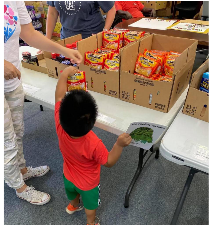
Summer Snack Shack. Top left: Food collected for breakfasts, lunches, and snack. Bottom Left: Food donated. Right: Little boy shopping for his own lunch food.